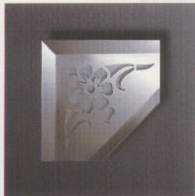
Etched Blossom Instead-A-Miter