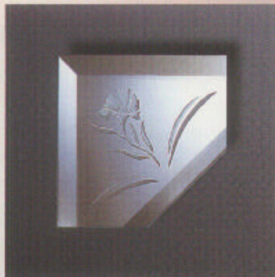
Etched Floral Instead-A-Miter