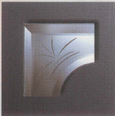
Etched Classic Majestic