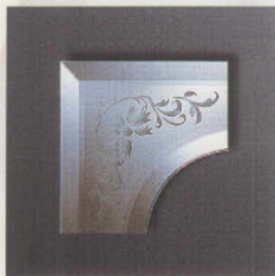
Etched Filigree Majestic