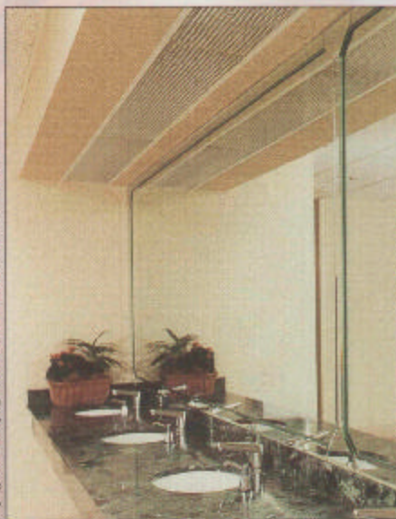
Mirrored Wall System

your company edges out all other competition.