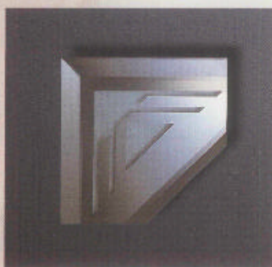
Etched Deco Instead-A-Miter