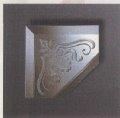
Etched Victorian Instead-A-Miter